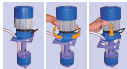
QUICK TWIST RELEASE

Above fixing surface: 76mm Below fixing surface: 116mm Fixing plate: 136.5mm x 90mm Weight: 140kg